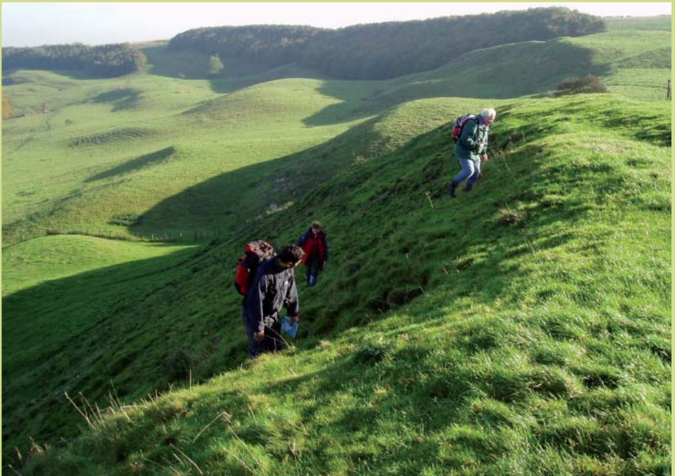
Birdsall Brow Landslide, nr Malton, North Yorkshire.

Using techniques including Socetset analysis of aerial photographs, analysis of NextMap and field survey, it was possible to identify and describe over 70 new landslides as well as three distinct landslide systems. The study also meant the discovery of large scale landslide features on the Chalk. These are on a scale previously undescribed away from the coast in Britain and represent the influence of Quaternary processes on the landscape of Northern England.