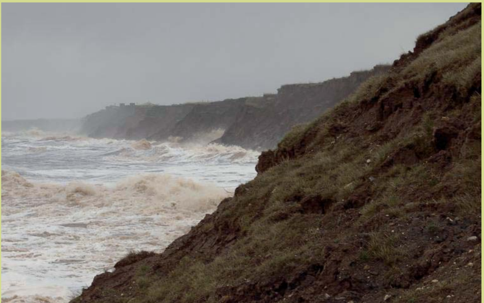
Coastal erosion, Holderness, North Yorkshire.

Results of cliff recession monitoring, using Global Positioning Systems (GPS), terrestrial laser scanning, digital photography and Geographical Information Systems (GIS) are displayed, which reveal a predominance of essentially translational landslides in the areas studied. It is shown how the results of these sophisticated monitoring methods can be combined with numerical modelling to gain a greater understanding of the processes involved in coastal recession. Finally, the results of this surveying are compared with published case studies of other coastal areas consisting of glacial or overconsolidated clay cliffs in order to assess similarities.