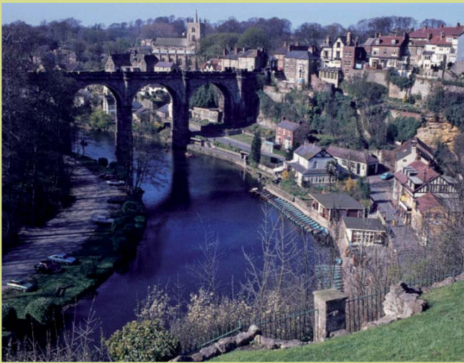
Knaresborough Gorge viewed from Knaresborough Castle showing the narrow gorge cut when the River Nidd was diverted by ice during the last Ice-Age.

of resources has become a major erosive force that has lowered large areas faster than natural erosion.